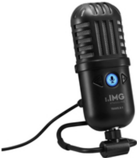
TRAVELX-1 Frequency Response