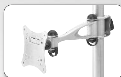
Table-mount support for one LCD monitor, 2 movable extension arms via 2 joints