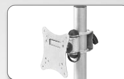
Table-mount support for one LCD monitor, movable and tiltable