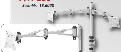
Table-mount support for 2 LCD monitors, 2 movable extension arms with 3 joints each