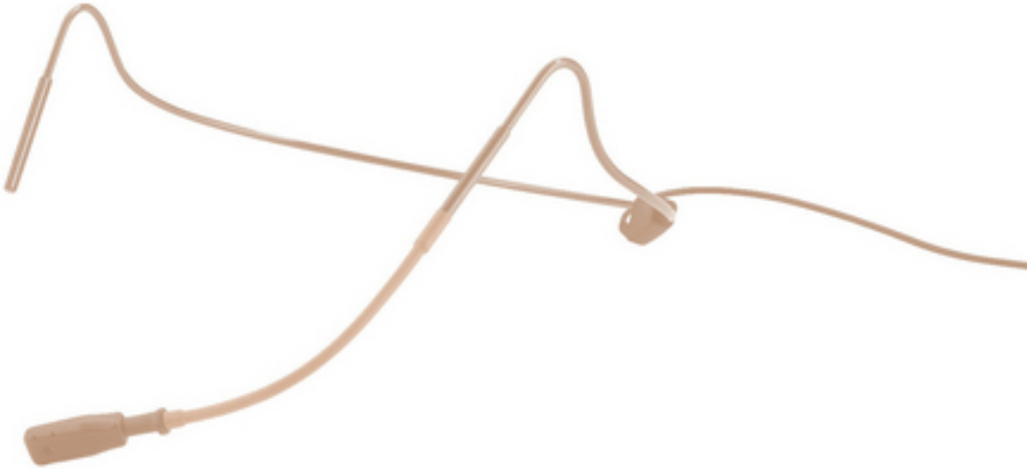
Umbau von 4-Pol-HSE-Kopfbügelmikrofonen zum Anschluss an JTS-Taschensender Reconfiguration of 4-pole HSE headband mics for the connection to JTS pocket transmitters